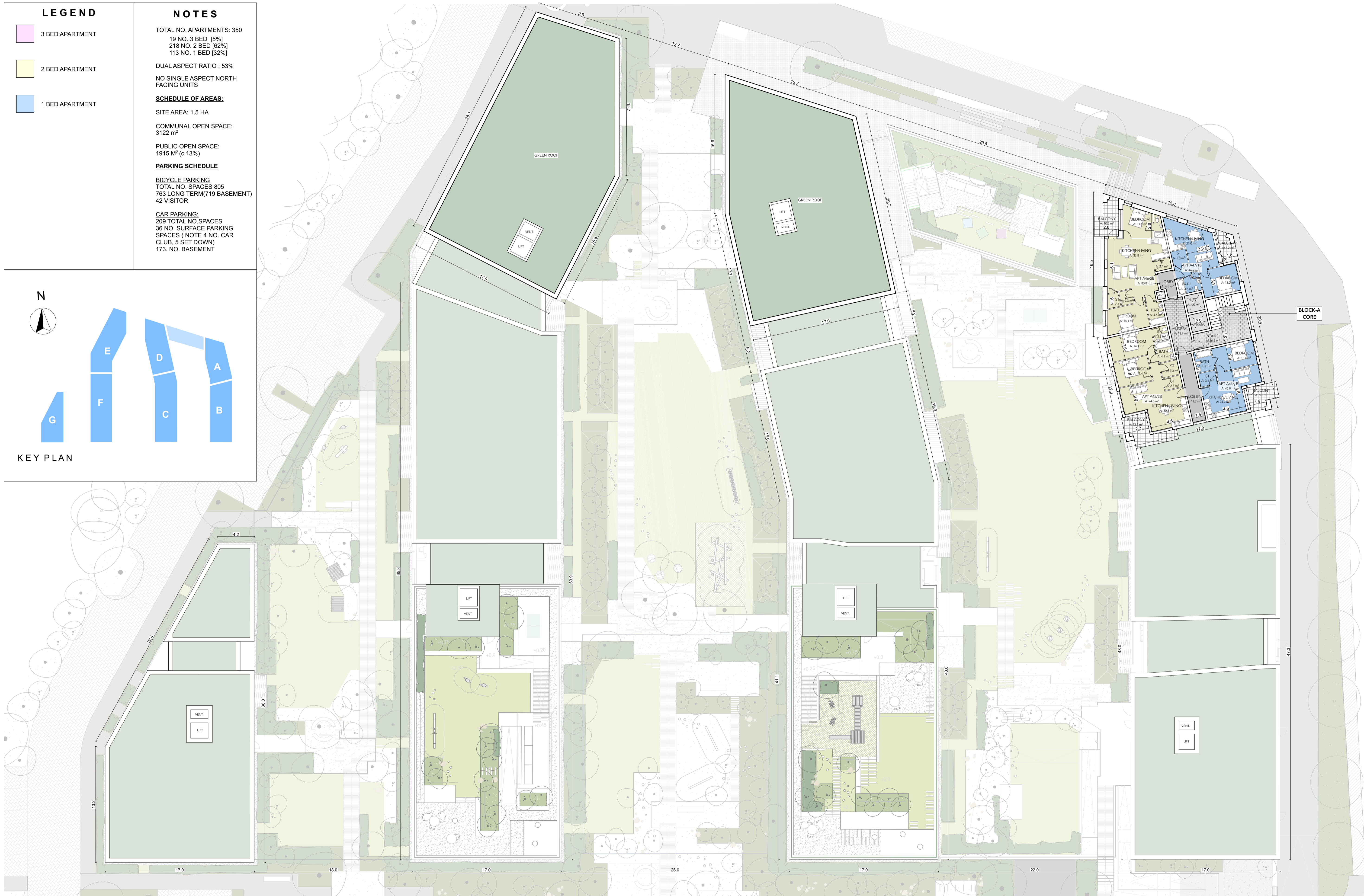
Tenth Floor Plan SCALE : 1:200